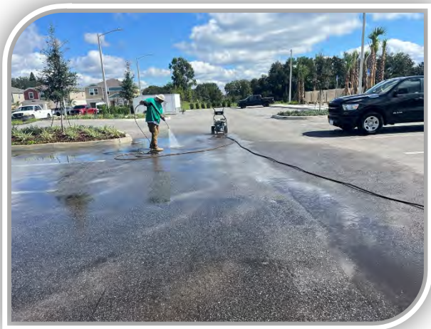
Photo Description: ✚ Parking lot pressure wash was completed prior to opening.